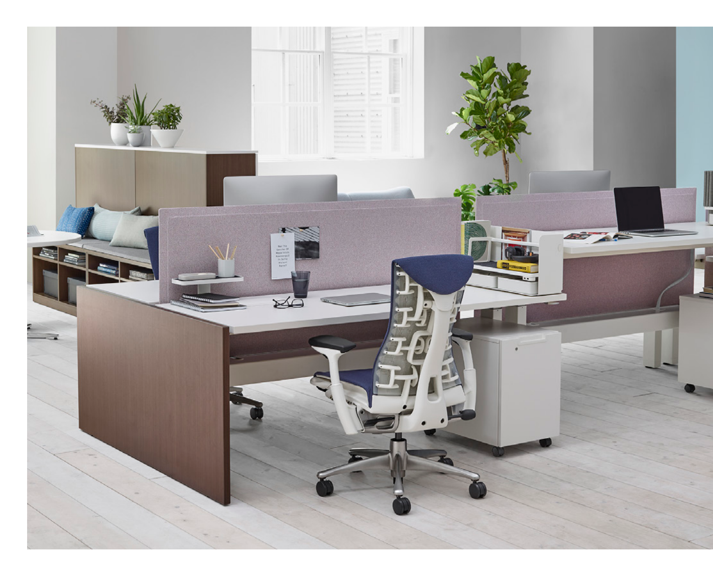
The \,versatile\, Ubi\, Work\, Tools\, portfolio\, works\, cross-platform\, on\, all\, Herman\, Miller\, benching\, and\, desking\, solutions.

Depending on which items a person is using and what tasks are being performed, workers can assemble Ubi Work Tools accordingly. Whether a workspace is owned or used on a drop-in basis, the portfolio allows each individual to feel at home while in the office and work more efficiently.