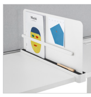
Slim Screen and Document Clip