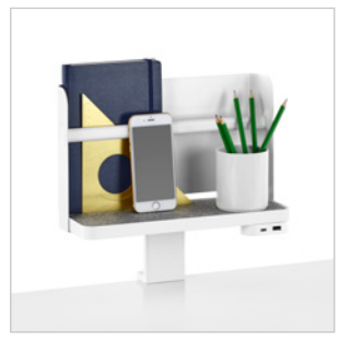
Attached Shelf with Backdrop