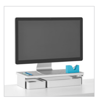
Monitor Platform Shelf