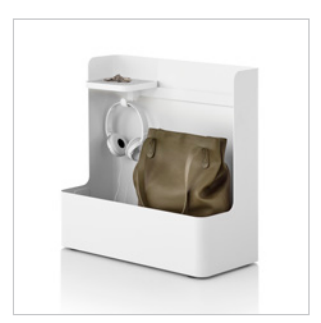
Mobile Bag Catch